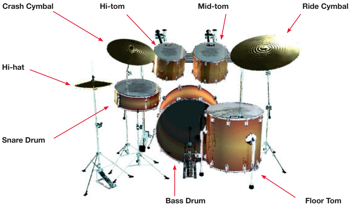
An acoustic drum kit in the standard arrangement